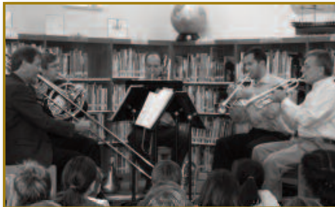
In residency situations with younger audiences, performing for a larger group is the culmination of numerous preparatory activities