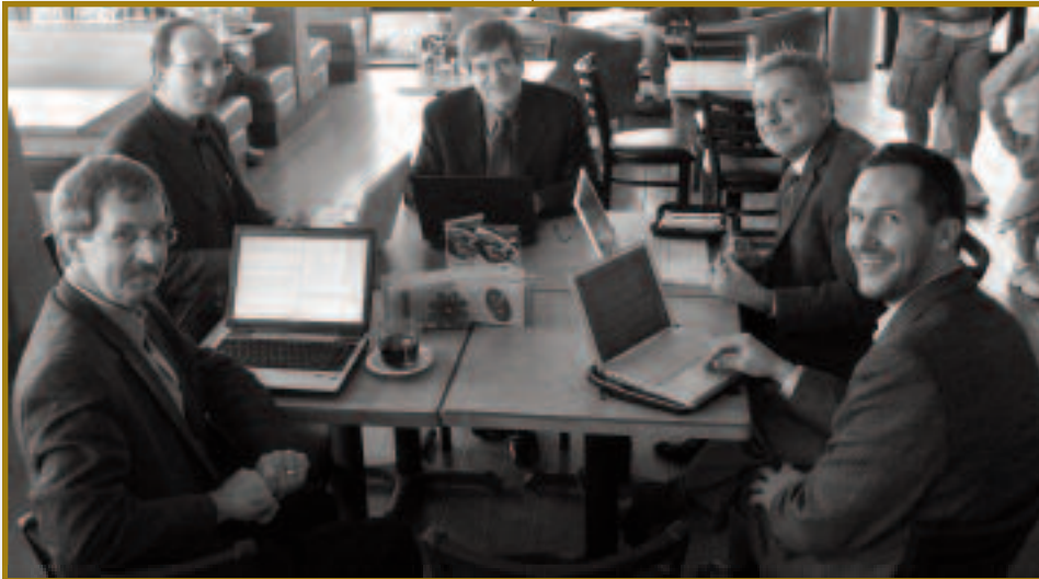
In Ashland, Oregon the bacon and eggs breakfast has been replaced by Compaq and Vaio's with a side of Apple.