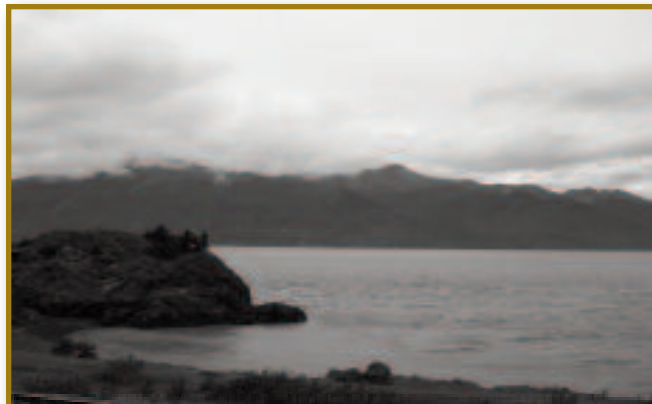
A view driving south from Anchorage to Seward, Alaska.

Last season started in spectacular fashion but we should have known that our good travel fortunes would mutate into trials of patience and endurance. There were lessons that we learned from our travails, so this season we decided to make some long drives to avoid connecting flights and misplaced baggage. And on these drives we'll have a chance to get our business meetings taken care of, unless the Yankees are on the radio.